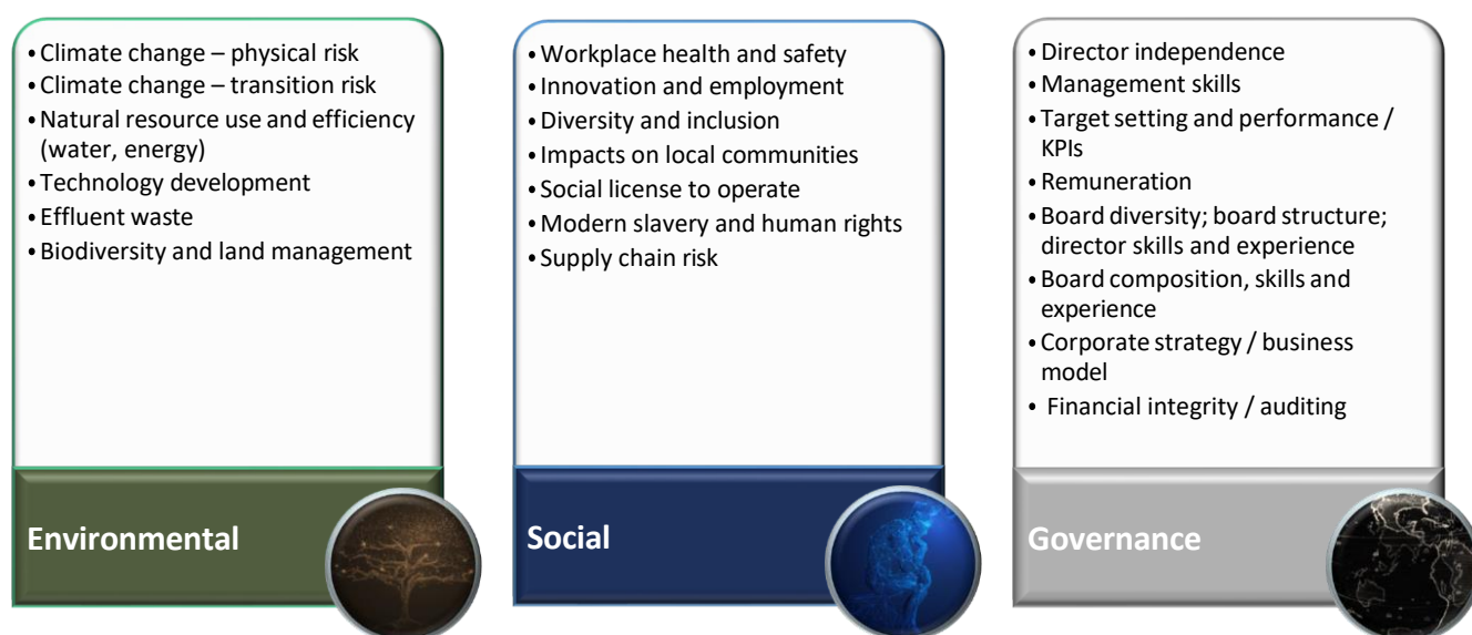
Figure 1 – Examples of ESG issues considered by Acorn Capital

Figure 1 includes examples of ESG issues considered by Acorn. Acorn also reviews penalties and controversies related to these topics.