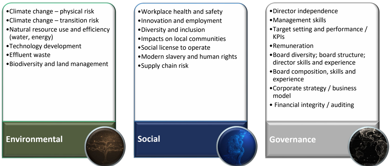
Figure 1 – Examples of ESG issues considered by Acorn Capital

Figure 1 includes examples of ESG issues considered by Acorn. Acorn also reviews penalties and controversies related to these topics.